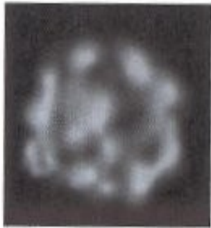
Single "big particle"